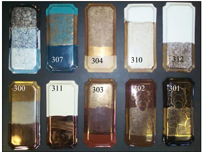
Metallic wonders include techniques using lusters, marbleizers and halo liquids. Category E